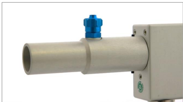
Blowing device for compact pyrometers Series KTRD / QKTRD 4000